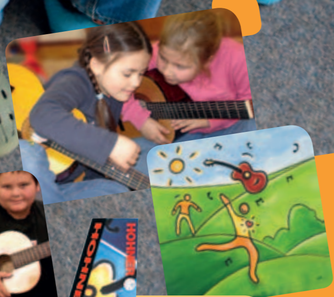
The HC-02, HC-03 and HC-06 guitars are delivered in an attractive full color boxes with handles – an ideal gift for the aspiring young guitarist.

HC - 02 This Student Half-Size Classical guitar has a scale length of 547 mm and fits children between 5-10 years of age. It has a spruce top, nato (eastern mahogany) back, sides and neck; Fingerboard and bridge are made of hardwood; 18 frets. Everything you need to get going: This guitar is also offered in a complete package including a gig bag, an extra set of strings and a string winder.